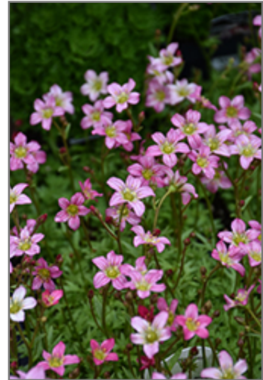
Touran Pink Saxifrage flowers

Touran Pink Saxifrage is recommended for the following landscape applications;