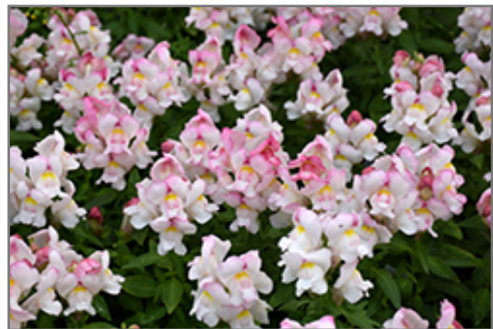
Snapshot Appleblossom Snapdragon flowers

7800 Roblin Boulevard Headingley, MB R4H 1B6