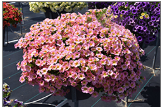
Superbells Honeyberry Calibrachoa in bloom