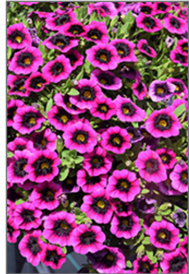
Superbells Blackcurrent Punch Calibrachoa flowers

Superbells Blackcurrent Punch Calibrachoa is recommended for the following landscape applications;