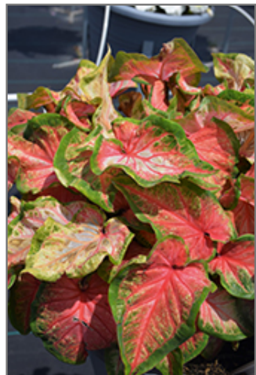
Heart to Heart Chinook Caladium foliage

7800 Roblin Boulevard Headingley, MB R4H 1B6