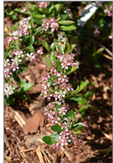
Ground Hug Aronia flowers