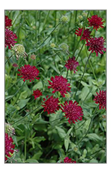
Crimson Scabious flowers

Crimson Scabious will grow to be about 24 inches tall at maturity extending to 3 feet tall with the flowers, with a spread of 24 inches. It tends to be leggy, with a typical clearance of 1 foot from the ground, and should be underplanted with lower-growing perennials. It grows at a fast rate, and under ideal conditions can be expected to live for approximately 3 years. As an herbaceous perennial, this plant will usually die back to the crown each winter, and will regrow from the base each spring. Be careful not to disturb the crown in late winter when it may not be readily seen!