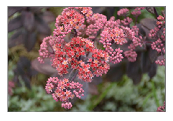
Night Embers Stonecrop flowers