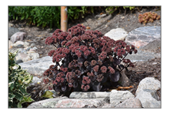
Night Embers Stonecrop in bloom

Night Embers Stonecrop is a dense herbaceous perennial with an upright spreading habit of growth. Its relatively coarse texture can be used to stand it apart from other garden plants with finer foliage.