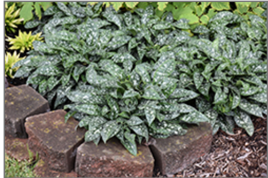
Twinkle Toes Lungwort

Twinkle Toes Lungwort will grow to be about 12 inches tall at maturity, with a spread of 18 inches. When grown in masses or used as a bedding plant, individual plants should be spaced approximately 15 inches apart. Its foliage tends to remain dense right to the ground, not requiring facer plants in front. It grows at a medium rate, and under ideal conditions can be expected to live for approximately 10 years. As an herbaceous perennial, this plant will usually die back to the crown each winter, and will regrow from the base each spring. Be careful not to disturb the crown in late winter when it may not be readily seen!