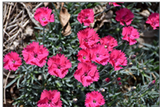
Paint The Town Magenta Pinks flowers