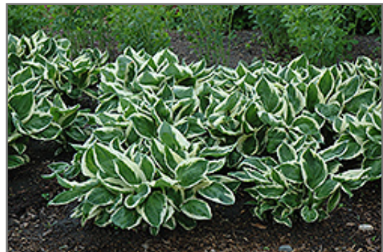
Minuteman Hosta