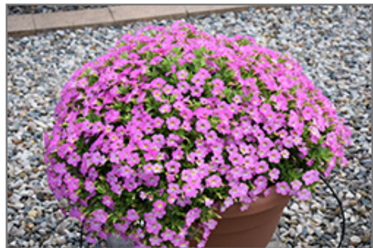
Chameleon Pink Passion Calibrachoa in bloom