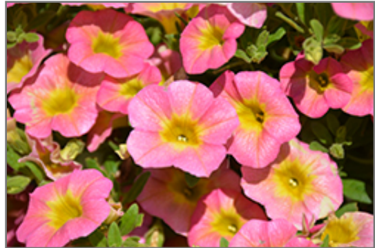
Callie Pink Morn Calibrachoa flowers

Callie Pink Morn Calibrachoa is recommended for the following landscape applications;