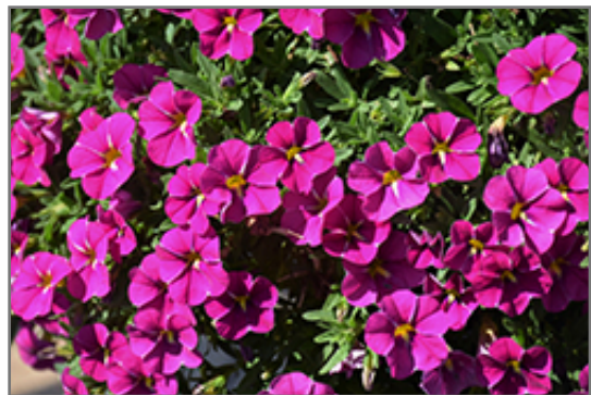
Cabaret Pink Star Calibrachoa flowers

7800 Roblin Boulevard Headingley, MB R4H 1B6