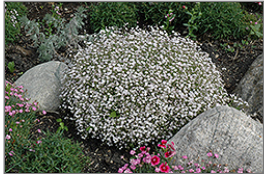
Creeping Baby's Breath in bloom