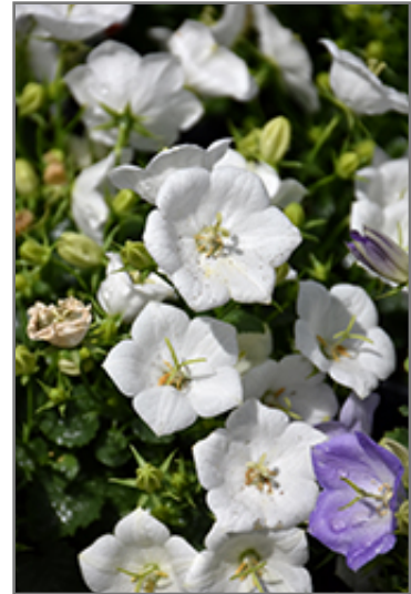
Rapido White Bellflower flowers