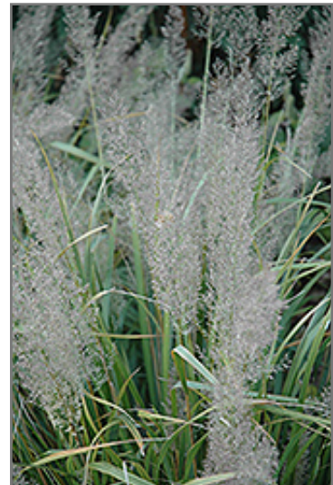
Korean Reed Grass fruit