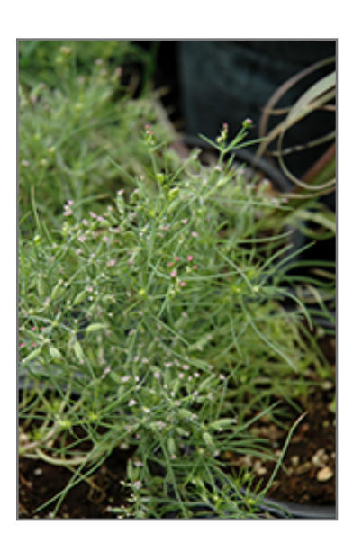
Cumin flowers

This plant is typically grown in a designated herb garden. It should only be grown in full sunlight. It is very adaptable to both dry and moist growing conditions, but will not tolerate any standing water. It is not particular as to soil type or pH. It is somewhat tolerant of urban pollution. This species is not originally from North America.