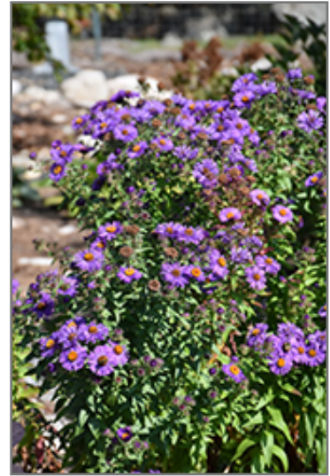
Purple Beauty Aster flowers

This plant does best in full sun to partial shade. It prefers to grow in average to moist conditions, and shouldn't be allowed to dry out. It is not particular as to soil type or pH. It is somewhat tolerant of urban pollution. This is a selection of a native North American species. It can be propagated by division; however, as a cultivated variety, be aware that it may be subject to certain restrictions or prohibitions on propagation.