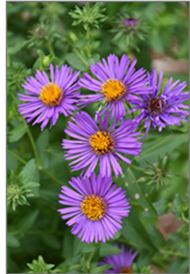
Purple Beauty Aster flowers