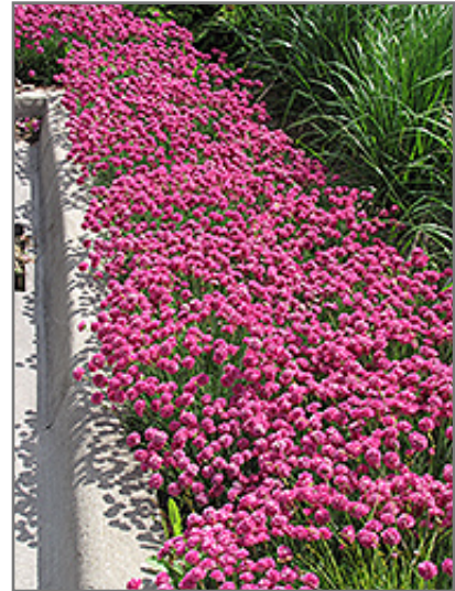
Dusseldorf Pride Sea Thrift in bloom

Dusseldorf Pride Sea Thrift is recommended for the following landscape applications;