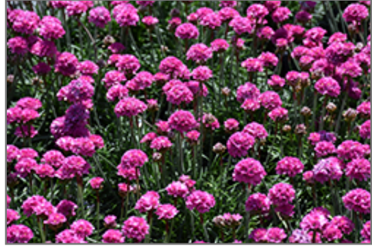
Dusseldorf Pride Sea Thrift flowers

Dusseldorf Pride Sea Thrift will grow to be only 6 inches tall at maturity extending to 8 inches tall with the flowers, with a spread of 8 inches. Its foliage tends to remain low and dense right to the ground. It grows at a slow rate, and under ideal conditions can be expected to live for approximately 10 years. As an evergreen perennial, this plant will typically keep its form and foliage year-round.