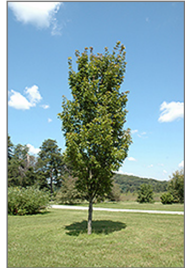
Red Rocket Red Maple

This tree should only be grown in full sunlight. It is quite adaptable, preferring to grow in average to wet conditions, and will even tolerate some standing water. It is not particular as to soil type, but has a definite preference for acidic soils, and is subject to chlorosis (yellowing) of the foliage in alkaline soils. It is somewhat tolerant of urban pollution. This is a selection of a native North American species.