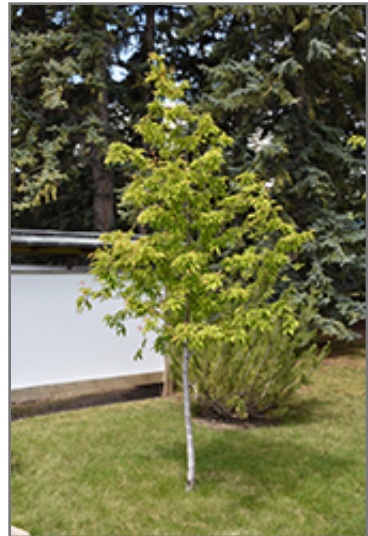
Amur Maple (tree form)