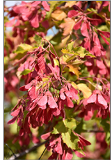
Amur Maple (tree form) fruit

This tree does best in full sun to partial shade. It is very adaptable to both dry and moist locations, and should do just fine under average home landscape conditions. It is not particular as to soil type or pH. It is highly tolerant of urban pollution and will even thrive in inner city environments. This is a selected variety of a species not originally from North America.