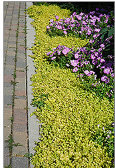
Golden Creeping Jenny

7800 Roblin Boulevard Headingley, MB R4H 1B6