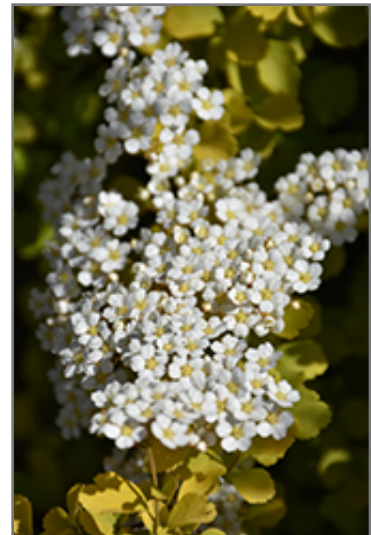
Glow Girl Birch Leaf Spirea flowers

7800 Roblin Boulevard Headingley, MB R4H 1B6