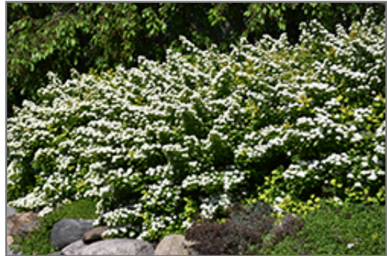
Glow Girl Birch Leaf Spirea in bloom

Glow Girl Birch Leaf Spirea is recommended for the following landscape applications;