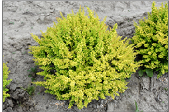
Sunsation Japanese Barberry

Sunsation Japanese Barberry is recommended for the following landscape applications;