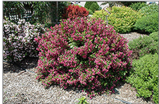
Minuet Weigela in bloom