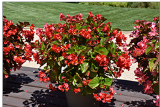
Whopper Red Green Leaf Begonia flowers

7800 Roblin Boulevard Headingley, MB R4H 1B6