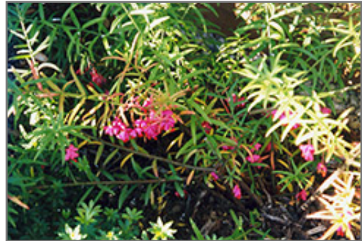
Dwarf Turkestan Burning Bush flowers

This shrub performs well in both full sun and full shade. It is very adaptable to both dry and moist locations, and should do just fine under typical garden conditions. It is not particular as to soil type or pH. It is highly tolerant of urban pollution and will even thrive in inner city environments. This is a selected variety of a species not originally from North America.