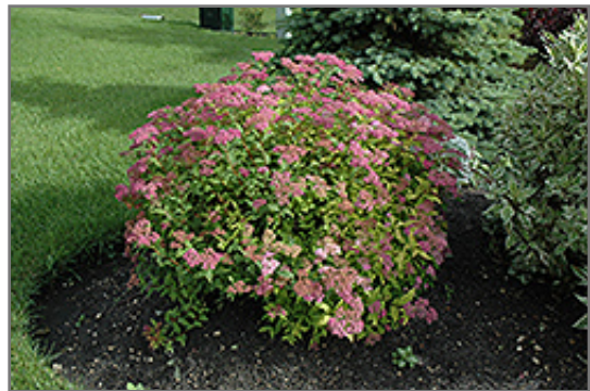
Goldflame Spirea in bloom