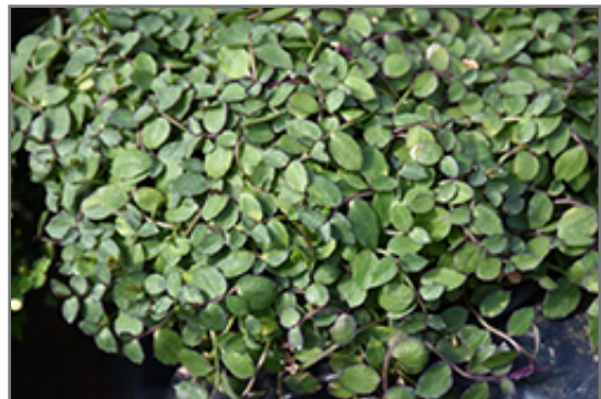
County Park Star Creeper foliage