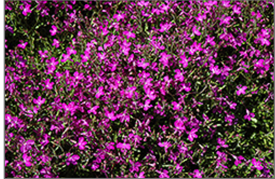
Techno Violet Lobelia flowers

Techno Violet Lobelia is a fine choice for the garden, but it is also a good selection for planting in hanging baskets. Because of its trailing habit of growth, it is ideally suited for use as a 'spiller' in the 'spiller-thriller-filler' container combination; plant it near the edges where it can spill gracefully over the pot. Note that when growing plants in outdoor containers and baskets, they may require more frequent waterings than they would in the yard or garden.