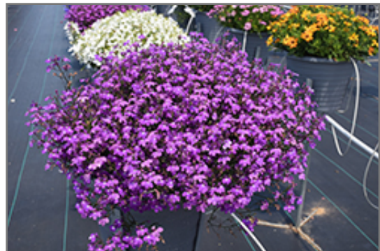
Techno Violet Lobelia in bloom

7800 Roblin Boulevard Headingley, MB R4H 1B6