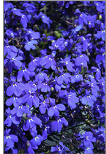
Techno Blue Lobelia flowers

Techno Blue Lobelia is recommended for the following landscape applications;