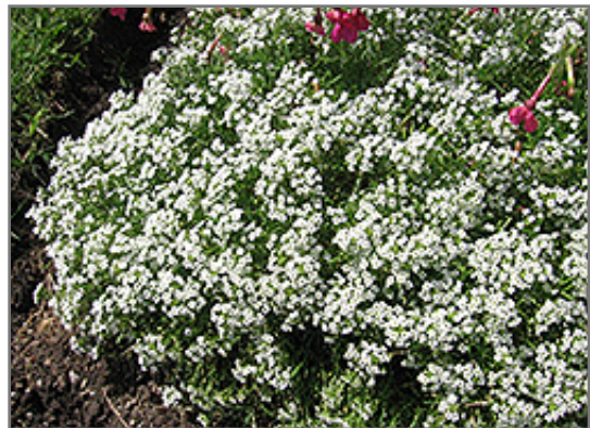
Wonderland White Alyssum in bloom