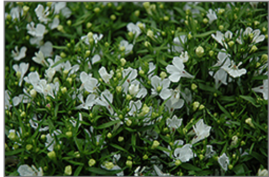
Riviera White Lobelia flowers

Hardiness Zone: (annual) Group/Class: Riviera Series