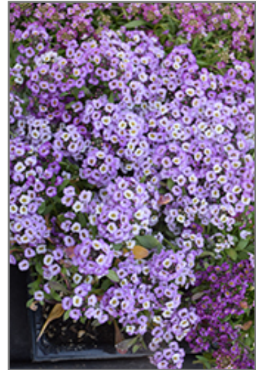
Clear Crystal Lavender Shades Sweet Alyssum flowers

Clear Crystal Lavender Shades Sweet Alyssum is recommended for the following landscape applications;