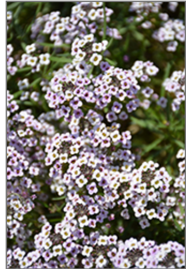
Blushing Princess Sweet Alyssum flowers

This plant will require occasional maintenance and upkeep, and should not require much pruning, except when necessary, such as to remove dieback. It is a good choice for attracting bees and butterflies to your yard, but is not particularly attractive to deer who tend to leave it alone in favor of tastier treats. It has no significant negative characteristics.