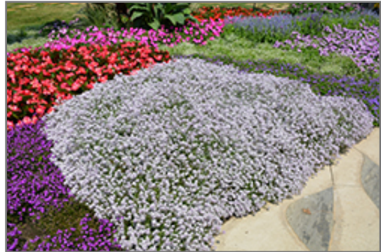
Blushing Princess Sweet Alyssum in bloom

Blushing Princess Sweet Alyssum is a fine choice for the garden, but it is also a good selection for planting in hanging baskets. Because of its trailing habit of growth, it is ideally suited for use as a 'spiller' in the 'spiller-thriller-filler' container combination; plant it near the edges where it can spill gracefully over the pot. Note that when growing plants in outdoor containers and baskets, they may require more frequent waterings than they would in the yard or garden.