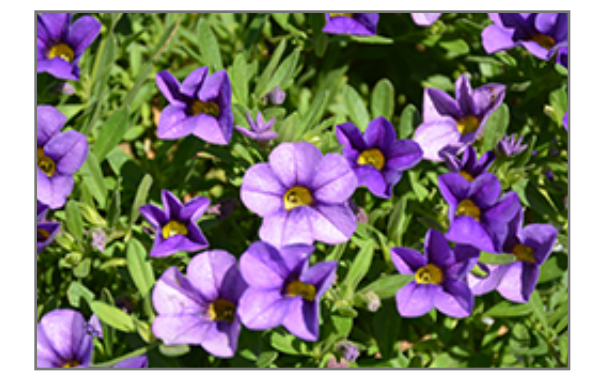
MiniFamous Compact Blue Calibrachoa flowers