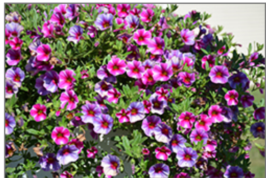
Can-Can Hot Pink Star Calibrachoa flowers