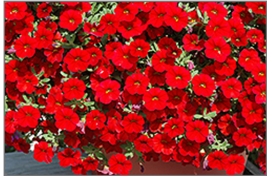
Cabaret Bright Red Calibrachoa flowers

This plant will require occasional maintenance and upkeep. Trim off the flower heads after they fade and die to encourage more blooms late into the season. It is a good choice for attracting bees and hummingbirds to your yard, but is not particularly attractive to deer who tend to leave it alone in favor of tastier treats. It has no significant negative characteristics.