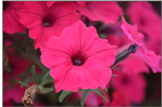
Supertunia Vista Fuchsia Petunia flowers

Supertunia Vista Fuchsia Petunia is recommended for the following landscape applications;