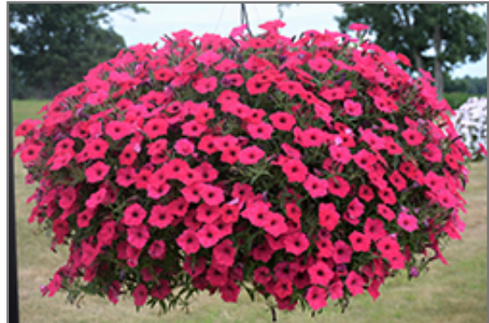
Supertunia Vista Fuchsia Petunia in bloom

7800 Roblin Boulevard Headingley, MB R4H 1B6