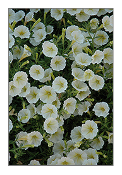
Pop Rocks Yellow Petunia flowers

P 204.895.7203 F 204.895.4372 www.shelmerdine.com