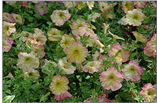
Debonair Dusty Rose Petunia flowers