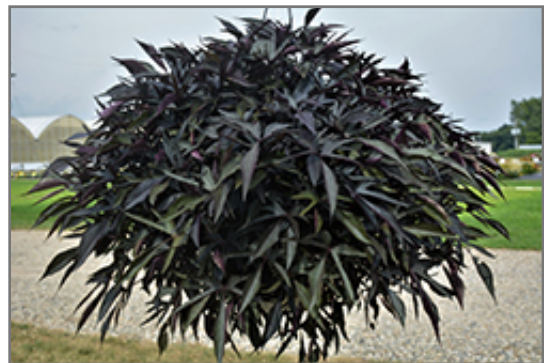
Illusion Midnight Lace Sweet Potato Vine