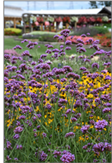
Buenos Aires Verbena flowers