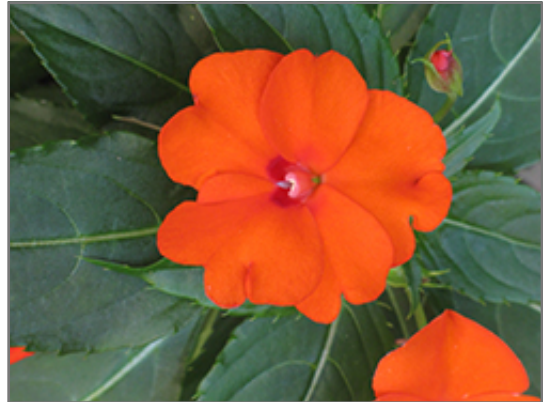
Infinity Orange New Guinea Impatiens flowers

Infinity Orange New Guinea Impatiens is recommended for the following landscape applications;