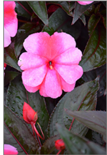
Super Sonic Sweet Cherry New Guinea Impatiens flowers

Super Sonic Sweet Cherry New Guinea Impatiens is recommended for the following landscape applications;