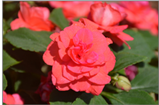
Rockapulco Coral Reef Impatiens flowers

Rockapulco Coral Reef Impatiens is recommended for the following landscape applications;