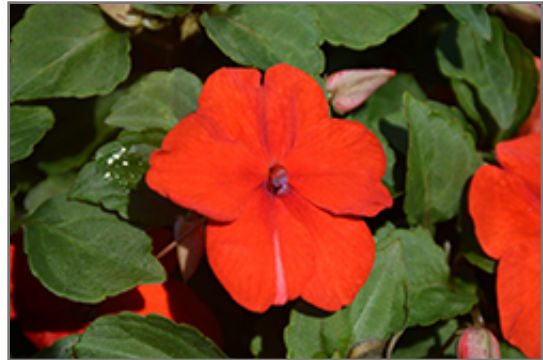
Super Elfin XP Scarlet Impatiens flowers

Super Elfin XP Scarlet Impatiens is recommended for the following landscape applications;