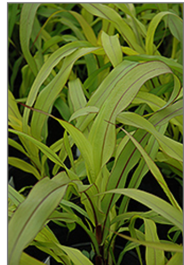
Jester Millet foliage