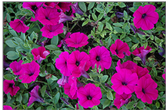
Wave Purple Classic Petunia flowers

7800 Roblin Boulevard Headingley, MB R4H 1B6